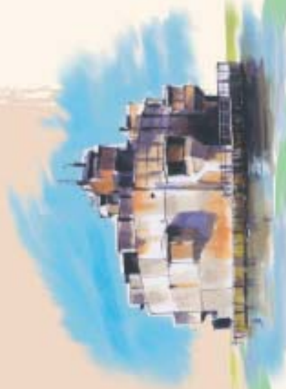
Hulle Sands Fort - a relic from WW1 which was part of the Humber Estuary submarine defences.

Louth Navigation meets the sea at Tetney Lock. This selection of walks will show you variety of natural water features from lagoons to Blow wells. The experience is exhilarating yet tranquil, no wonder so many birds choose to live here.